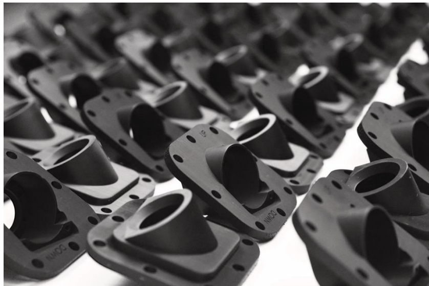
The Stratasys Origin One 3D printer is designed for mass production applications, such as these camera housings.