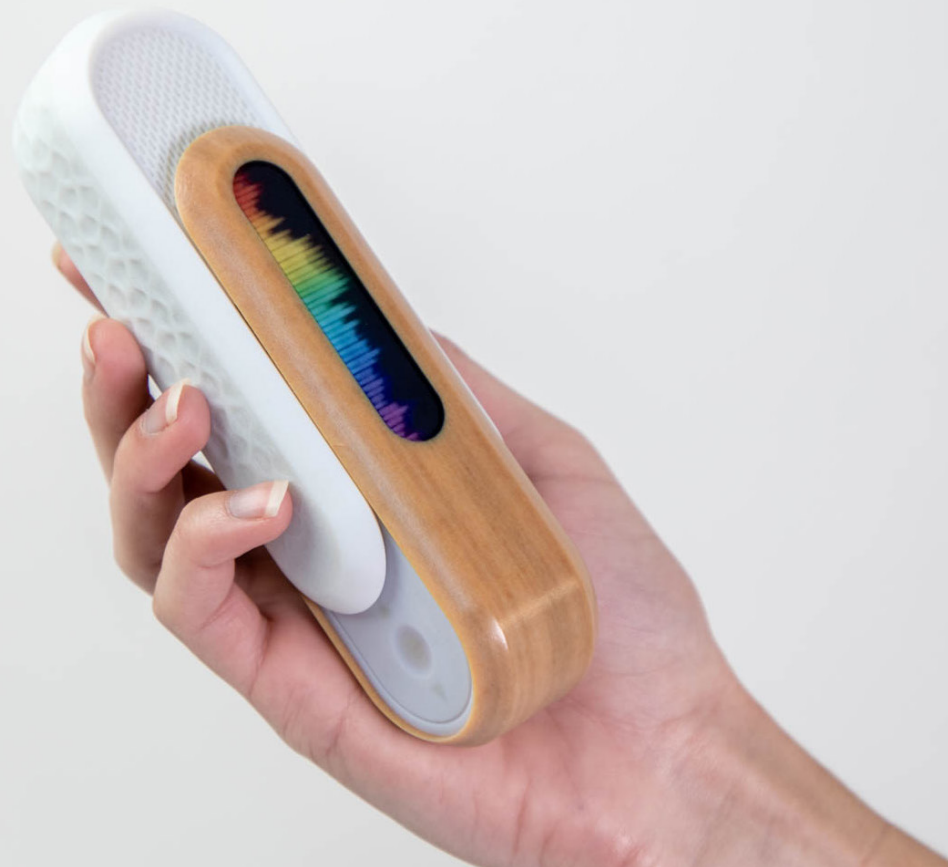
Speaker prototype 3D printed on the J55