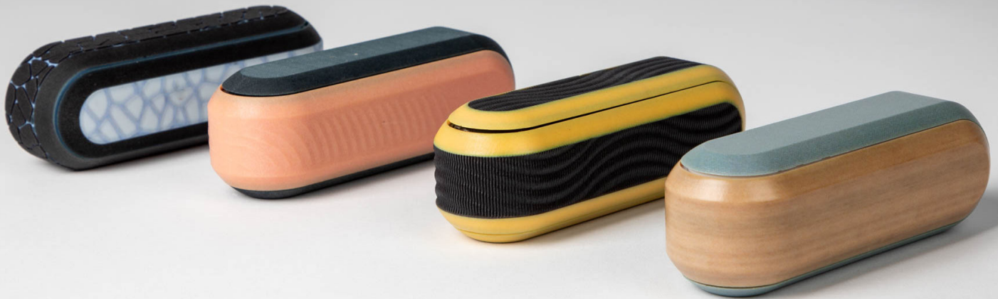
Early CMF explorations 3D printed on the J55

This workflow has major implications for how the team will approach future projects. Priority Designs uses KeyShot throughout the product design process – it offers a large material library and the renders help communicate ideas to clients. The ability to go from KeyShot render to 3D print with few steps in between saves time and makes it easier to create physical prototypes.