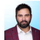
Tra' Chambers Express Dental Laboratory

“We've just been blown away with the products and the support that Stratasys has given us over the years.”