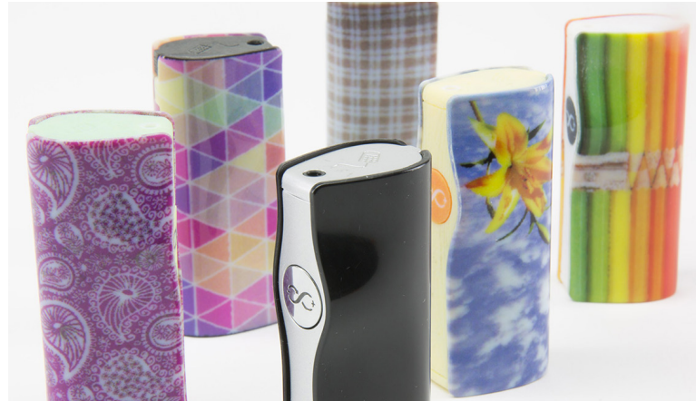
This mobile phone charger sleeve was prototyped with many image options.

So when Synergy redesigned a keypad for an emergency-response system used in the after-market automotive industry, the Stratasys J750 played a key role. The project meant producing multiple designs for the panel, which mounts above the rear-view mirror, to test which would best fit the car’s interior and pass ergonomic and mechanical testing. Each iteration included soft-touch buttons, backlighting, graphics, housing and internal connections to the electronic panel.