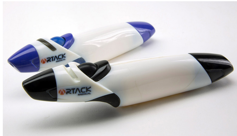
This articulated hernia mesh fixation device prototype was 3D printed complete with logo.