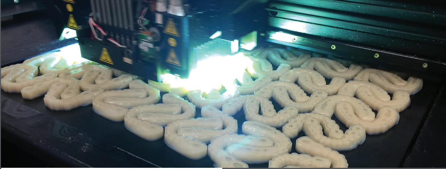
Protec Dental Lab's 3D printer in action