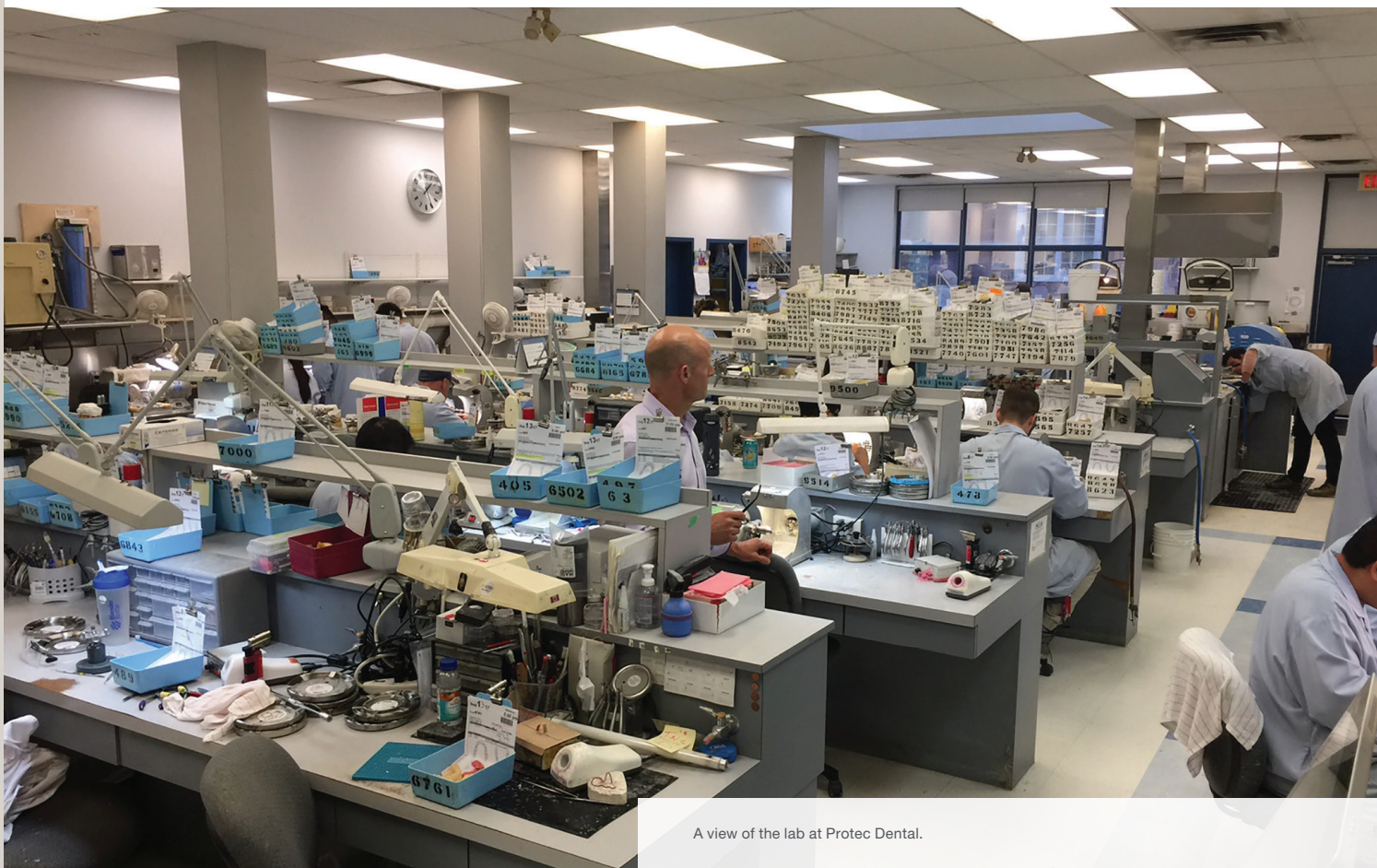
A view of the lab at Protec Dental.