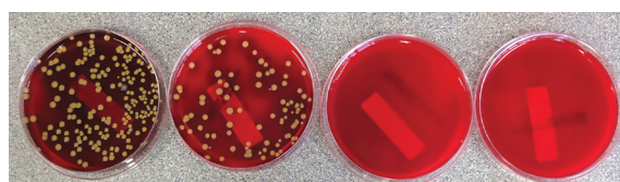
Figure 1: Test plates after 48 hours of incubation in Staphylococcus aureus . Note that T0 and T1 were diluted by 10^{-3} while T2 and T3 were not diluted.

Test plates for the four samples after 48 hours of incubation are shown in Figures 1 and 2. Large numbers of Staphylococcus aureus and E. coli were observed in T0 and T1 while none were observed in T2 and T3.