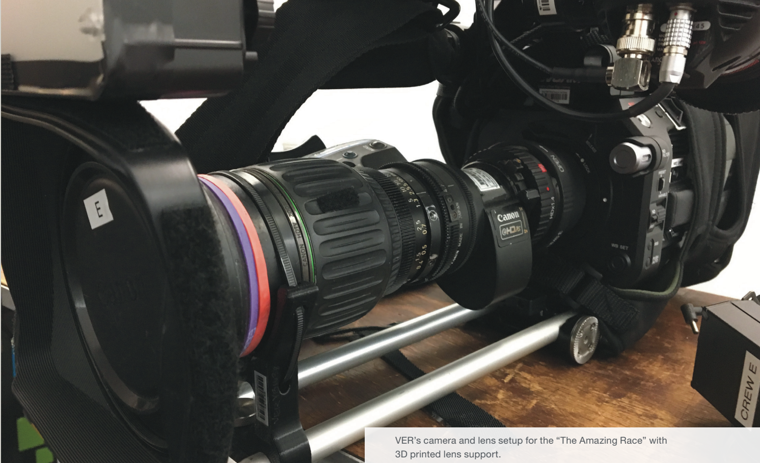
VER's camera and lens setup for the "The Amazing Race" with 3D printed lens support.