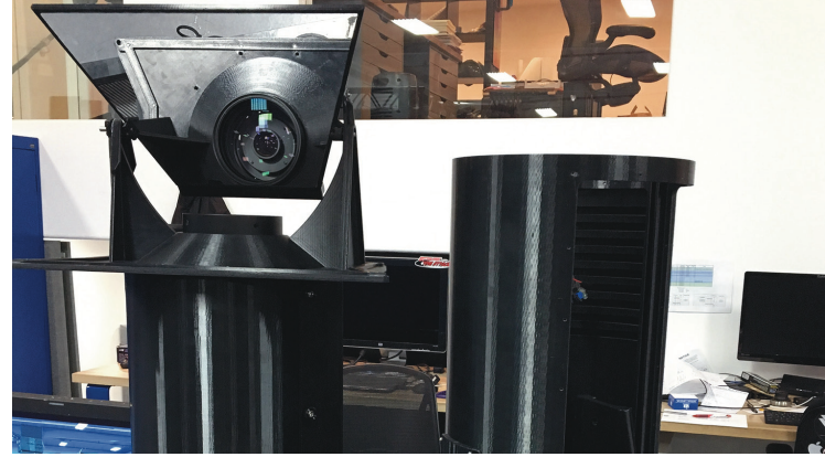
Iteration of camera “number two” for use in MLB ballparks.

Recovering this camera angle for viewers was a challenge taken on by stakeholders at VER, a video equipment rental house offering equipment and crew and design services for live broadcast sports, concert tours, TV and the entertainment industry. “We have a long-standing relationship with ESPN,” said Campbell, “and they’re always looking for ways to improve what they do.” ESPN approached VER with interest in regaining the camera position. The first step was to get approval from the MLB. VER designed and built a scale mockup using 3D printed parts and cardboard tubing to show the MLB the concept. Once they saw the scale of it, they were receptive to the idea and VER went to work on an actual working unit.